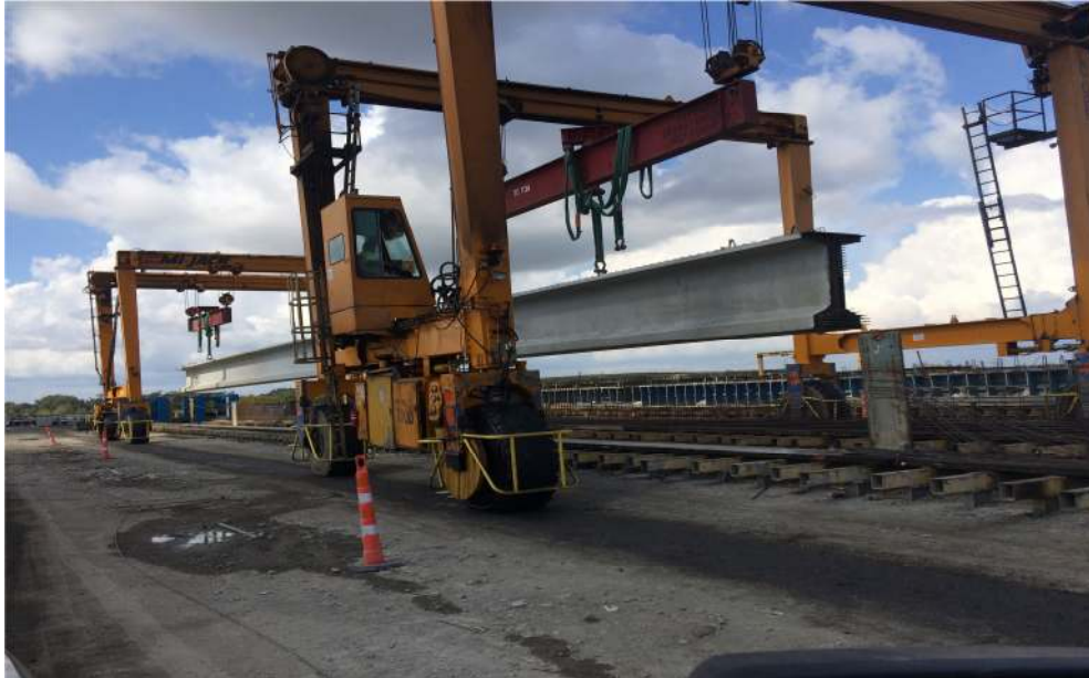
Figure 1. Typical prestressed bridge beam being fabricated

The precast concrete market represents a large portion of the total US concrete market. In particular, in addition to precast building products for low and high rise construction, the use of precast products is particularly common in the construction and maintenance of bridges, and the US bridge market is a primary target for the possible future use of EdenCrete®.