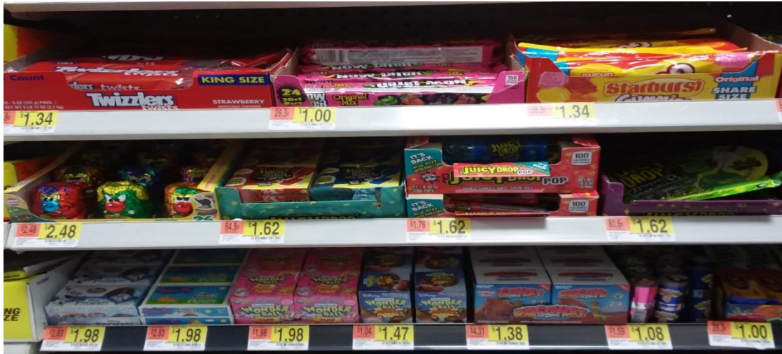
Figure 3: Yowie and Discovery World on shelf at a major US retailer

10.2% on a 4-week basis. In Grocery, ACV grew from 11.2% on a 52-week basis to 14.2% on a 4-week basis.