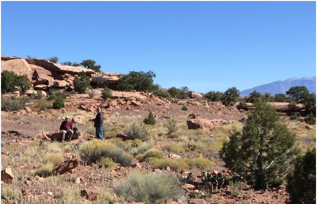
Figure1: Gold Bar Unit 2 Re-entry Site

An application to conduct drilling activities at Gold Bar Unit 2 had been accepted by the USA Federal agency, the Bureau of Land Management (BLM). A further approval by the BLM is still required before earth disturbance, including drilling activity, can commence. This approval is expected to be received in November 2017.