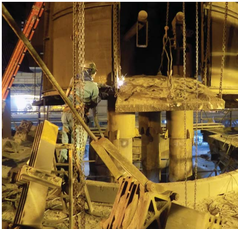
Figure 4: Dismantling of equipment at Transalloy's site