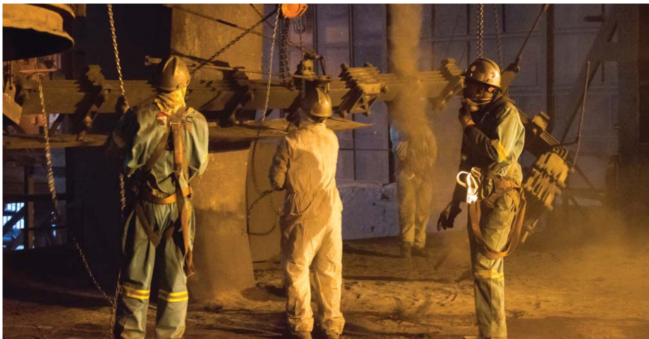
Figure 2: Dismantling of equipment at Transalloy's site