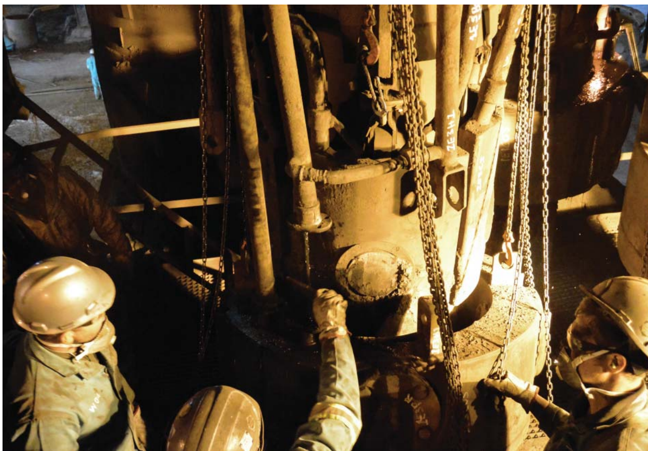
Figure 5: Dismantling of equipment at Transalloy's site

Manganese is the fourth most used metal in the world in terms of tonnage. In addition to steel, manganese is also used in the developing battery market and in fertilisers.