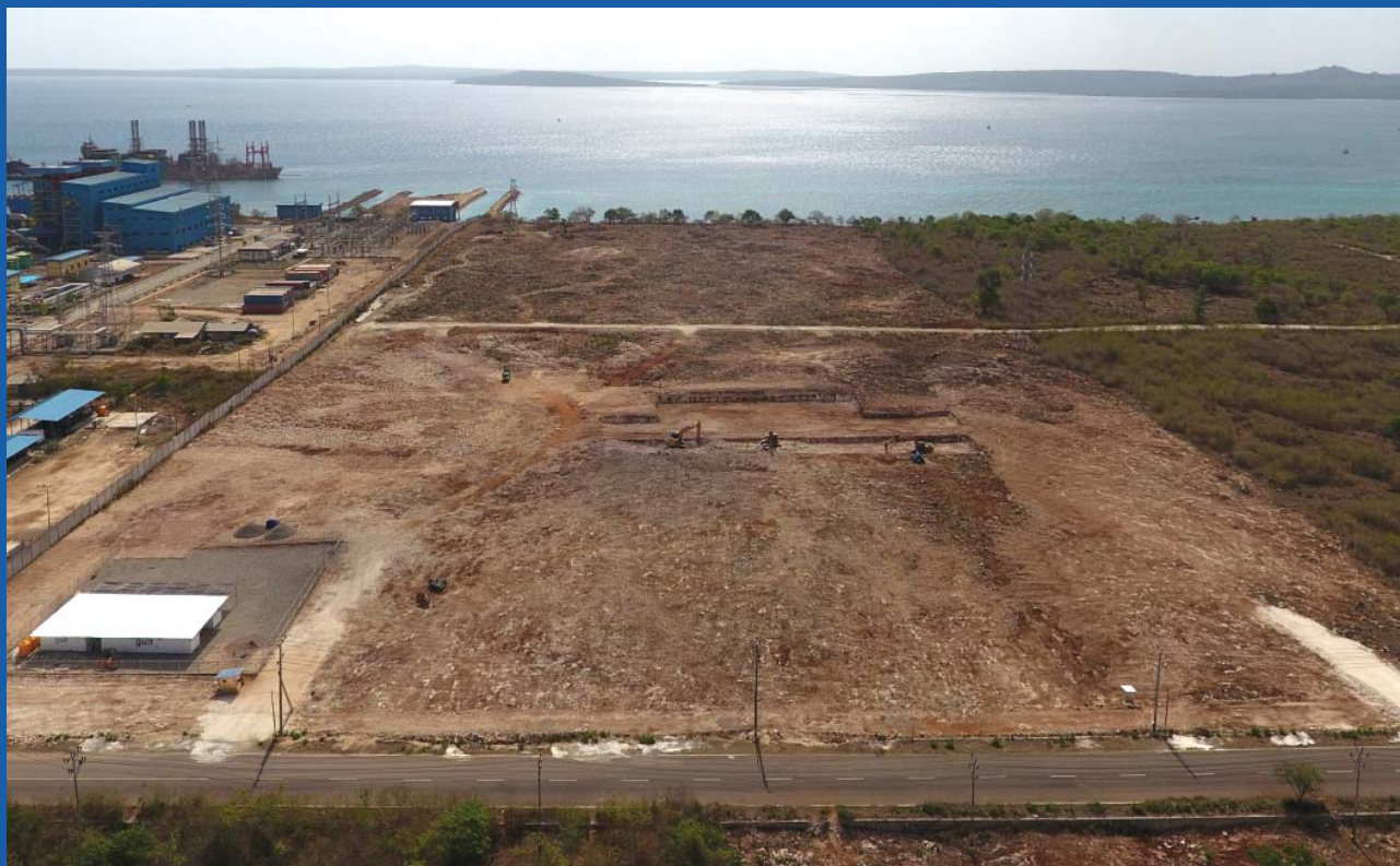
Figure 1: Construction Offices on cleared Bolok Industrial Site

demonstrates the capacity of our in-country team to engage with local groups and communities to build long-standing relationships.