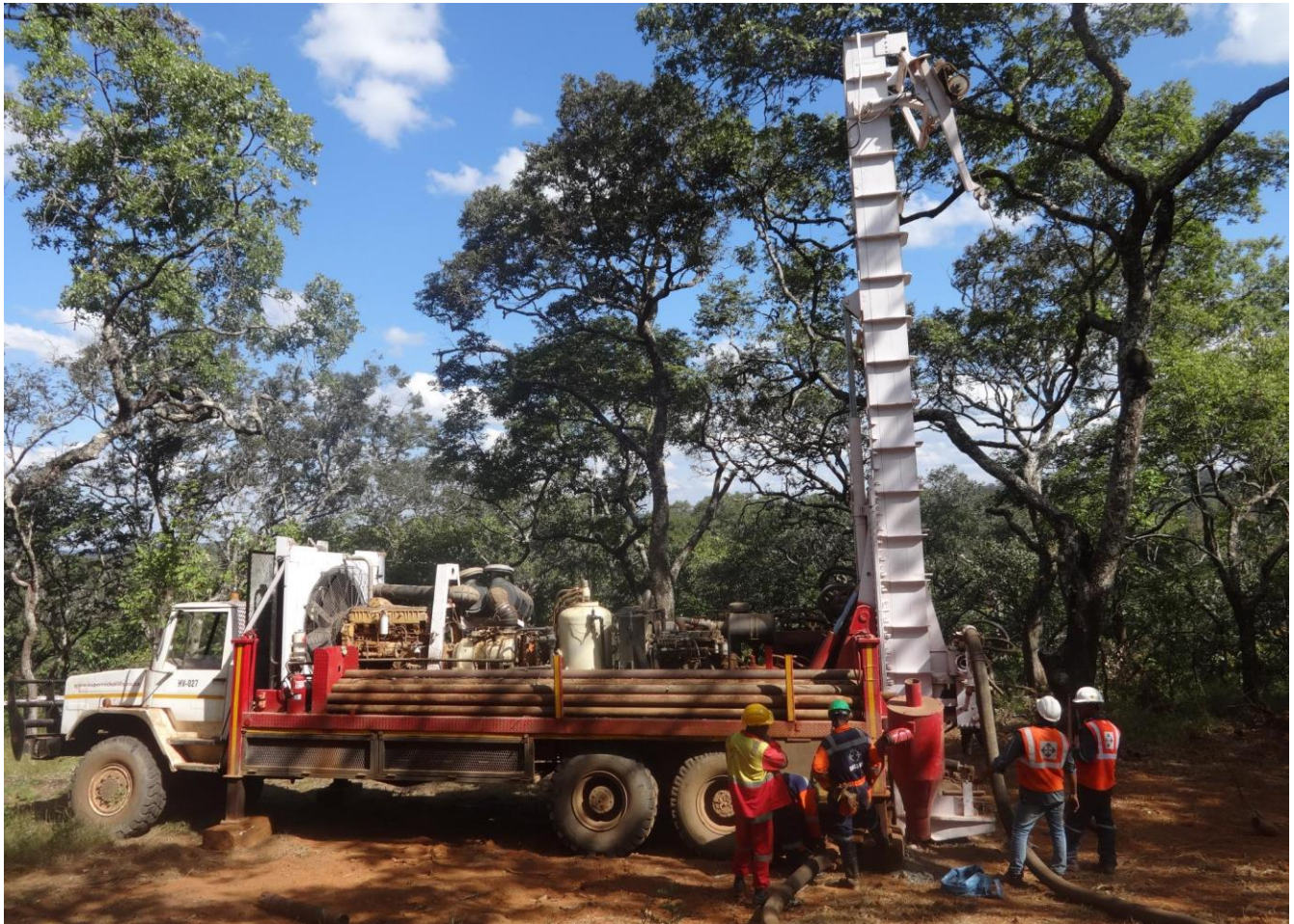
RC Drill rig at Monwezi exploration target

The combination of the aeromagnetic and radiometric datasets plus recent drilling data will prove invaluable in defining and refining targets on the licence, particularly in areas of poor outcrop.