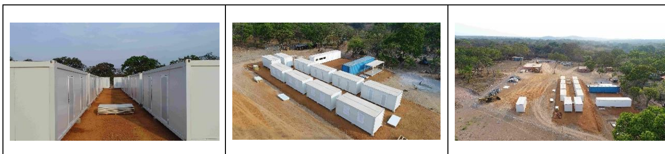
New accommodation buildings