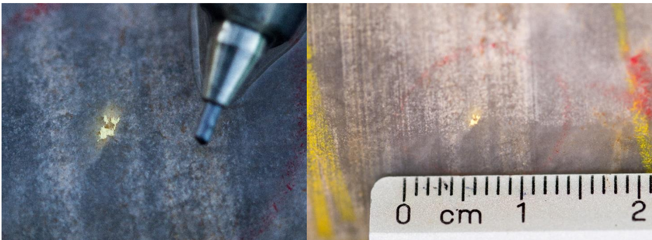
Figure 1. Visible free gold observed in drill core at Crown Prince.

This occurrence of visible gold in the primary zone well below the level of historical workings validates our aggressive approach to exploring the Garden Gully prospects and justifies our pursuit of the Crown Prince tenement. It augurs well for the rest of the drilling campaign currently underway.