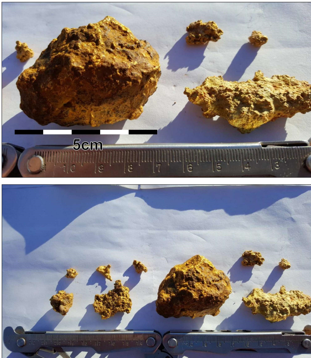
Figure 4. Some of the other large gold nuggets recovered from Mertondale.