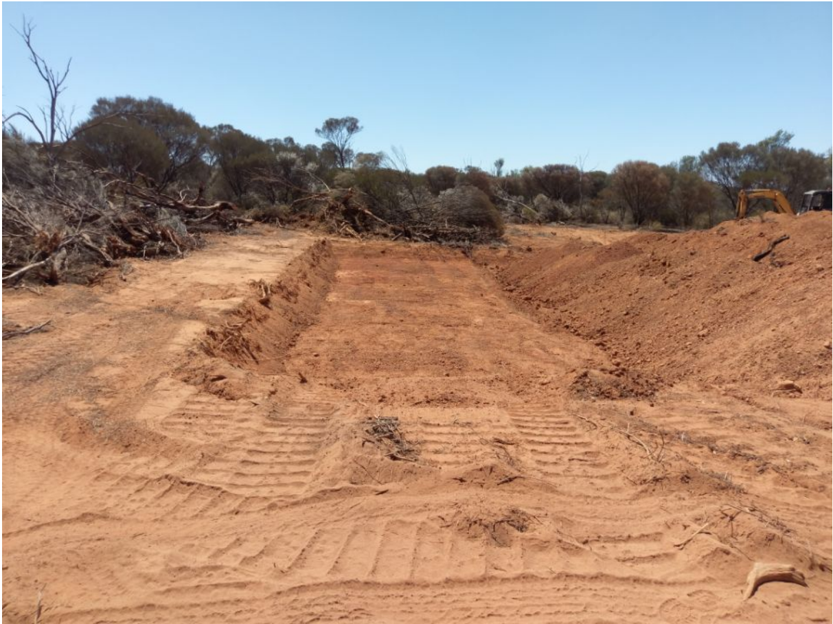
Figure 3. Excavation at Mertondale for some of the large nuggets including the 21oz nugget.