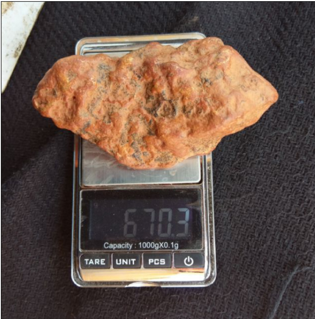
Figure 2. Large gold nugget 670g (21oz) recovered from Mertondale.