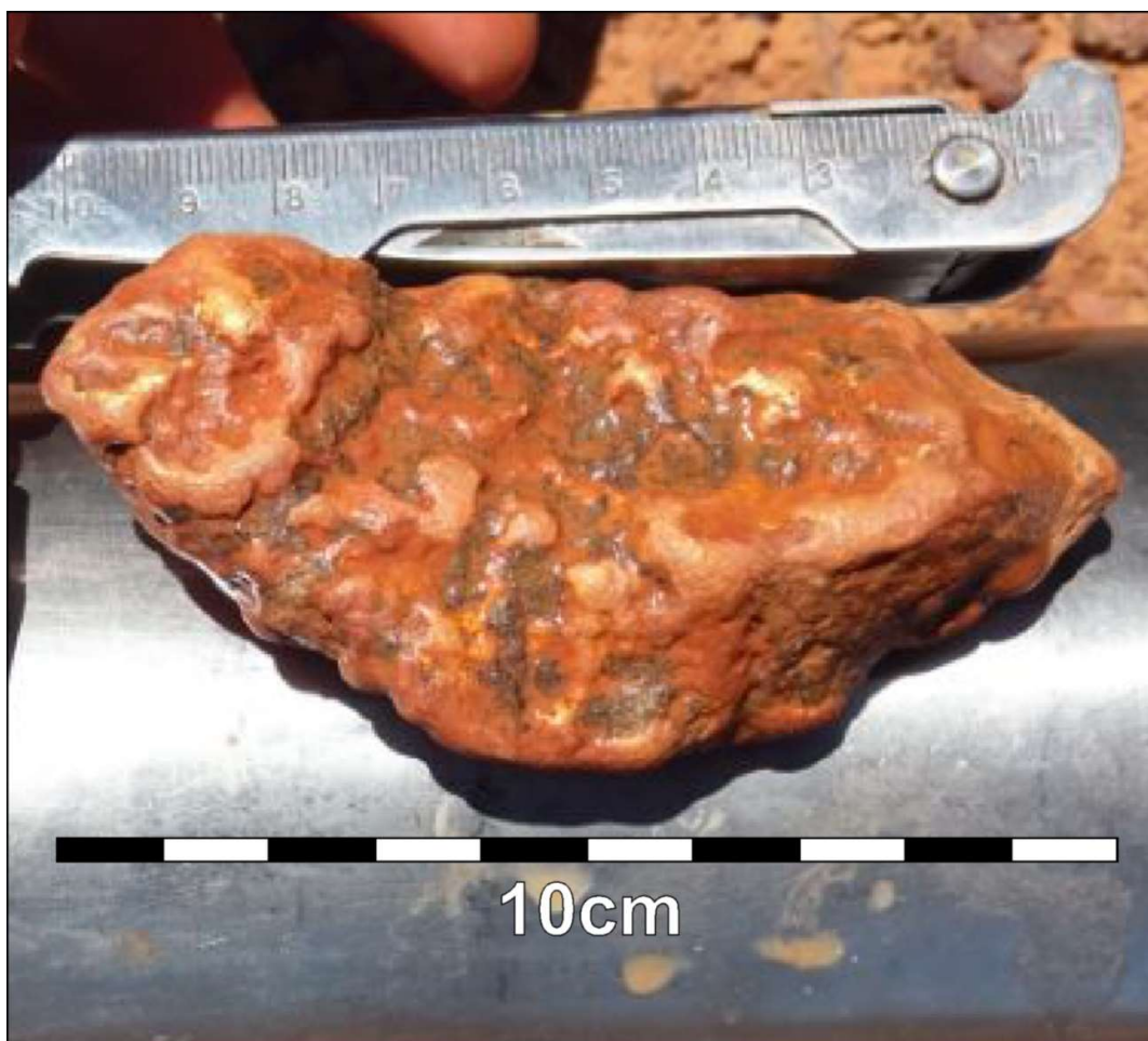
Figure 1. Large 21oz gold nugget recovered from Mertondale.