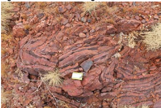
Figure 4: Folded BIF at Douglas Find