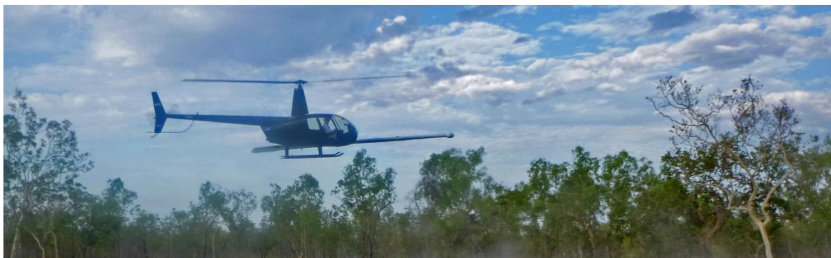
Helicopter undertaking airborne magnetic and radiometric survey over the Wollogorang Cobalt Project.

A detailed airborne aeromagnetic and radiometric survey has been commissioned over the main prospects at the Wollogorang Cobalt Project. The survey will be flown at a 25m line spacing to cover approximately 77 km 2 . The survey commenced on 17 November and should be completed within 3-4 days. The company expects that the survey will help prioritise drill targets and map out areas of undiscovered alteration and/or mineralisation. Results from this survey are expected before the end of the month.