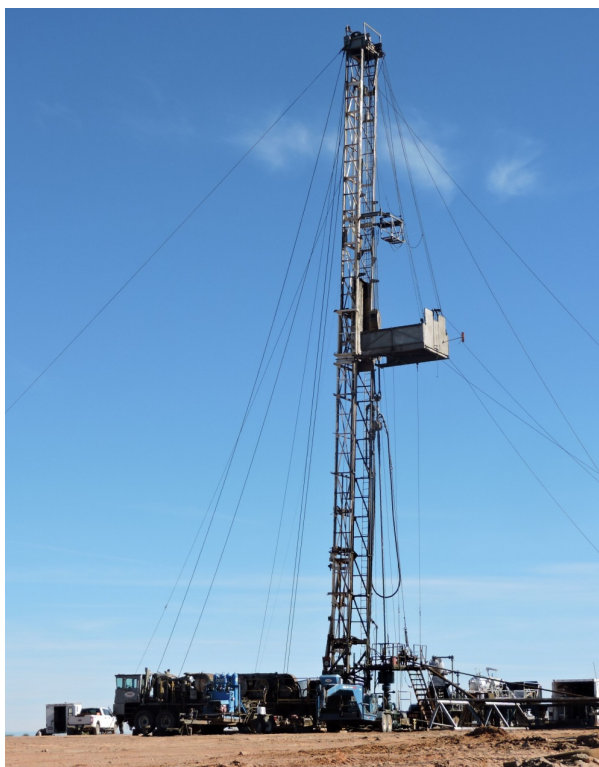
Figure 2: photo of a work over rig.

The drilling program will be the re-entry of an existing well, Gold Bar Unit 2, which was previously drilled through the multiple brine zones Anson is targeting to sample for lithium. The drilling will be via a work over rig, which is smaller and truck mounted compared to a rig used to drill a new hole. Accordingly the drilling program is faster and cheaper. A photo of a work over rig is shown below: