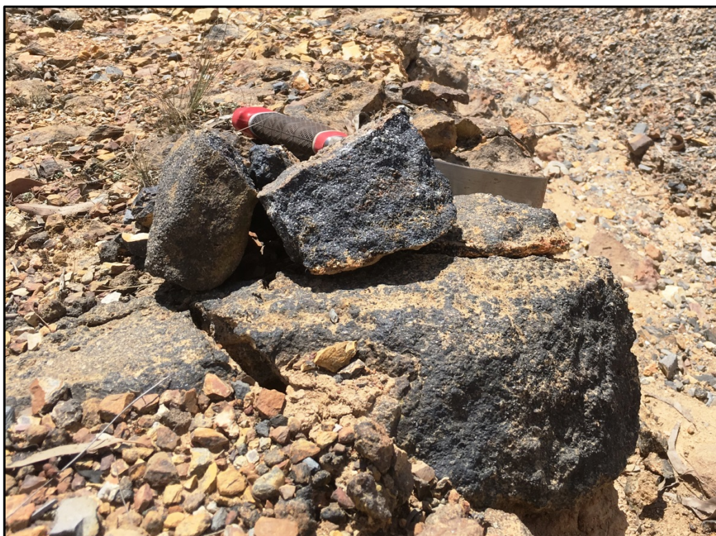
Figure 2. Typical coarse grained Mn-Co grit sample at Bungonia

Most historic work has focussed on 3 deposits out of more than 15 known occurrences. Very little historic drilling has been completed, some of which is documented as being ineffective due to encountering hard manganiferous grits that prevented proper assessment. The company will continue to expand and assess historic data sets while finalising access with key landowners in the area. Exploration will continue to further assess and rate the known prospects in order to prioritise for drilling in 2018.