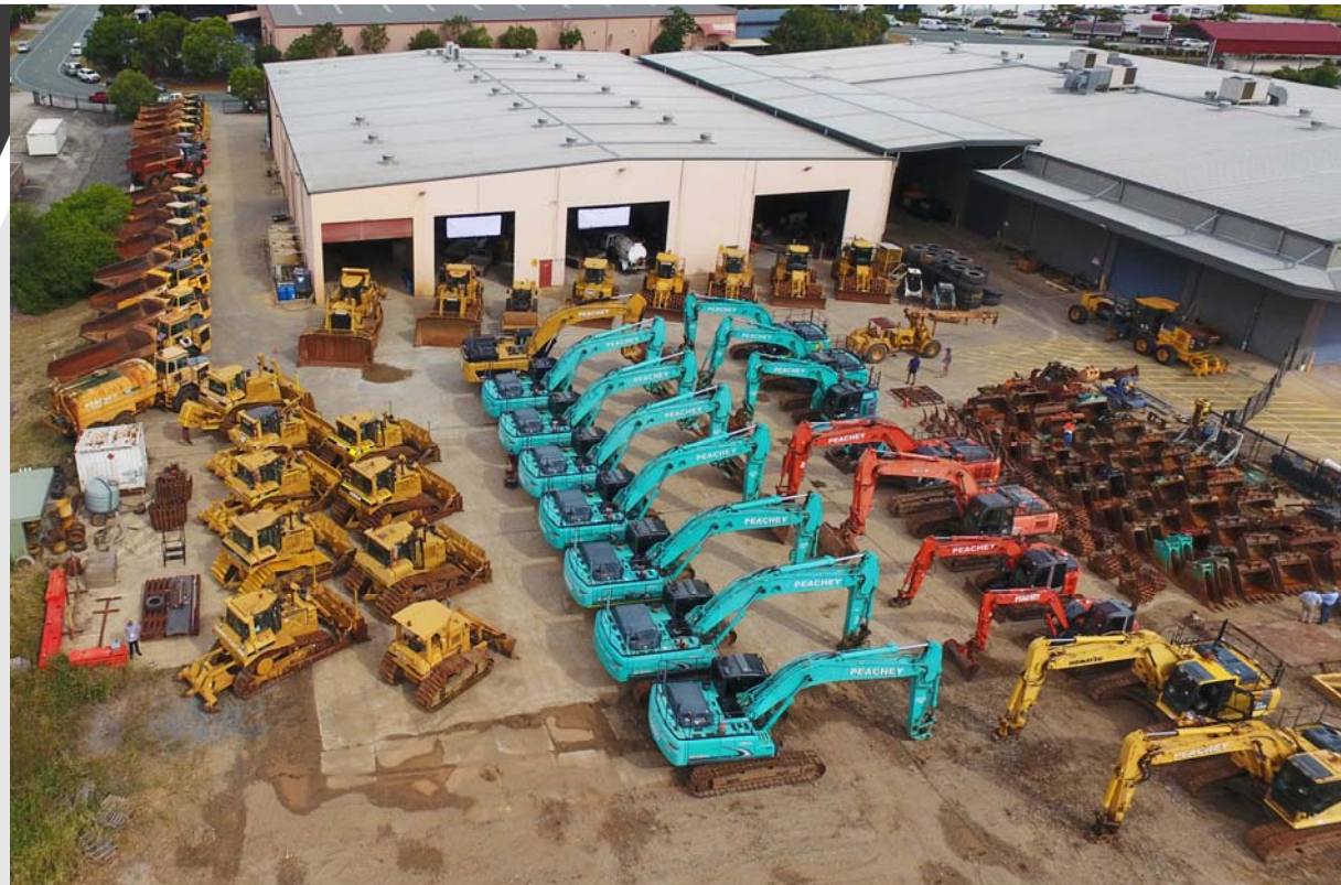
JOYCE CORPORATION LTD