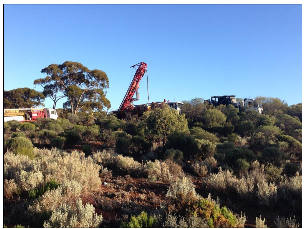
Figure 3: RC rig in operation at Target 18 at the Company's Zuleika project.