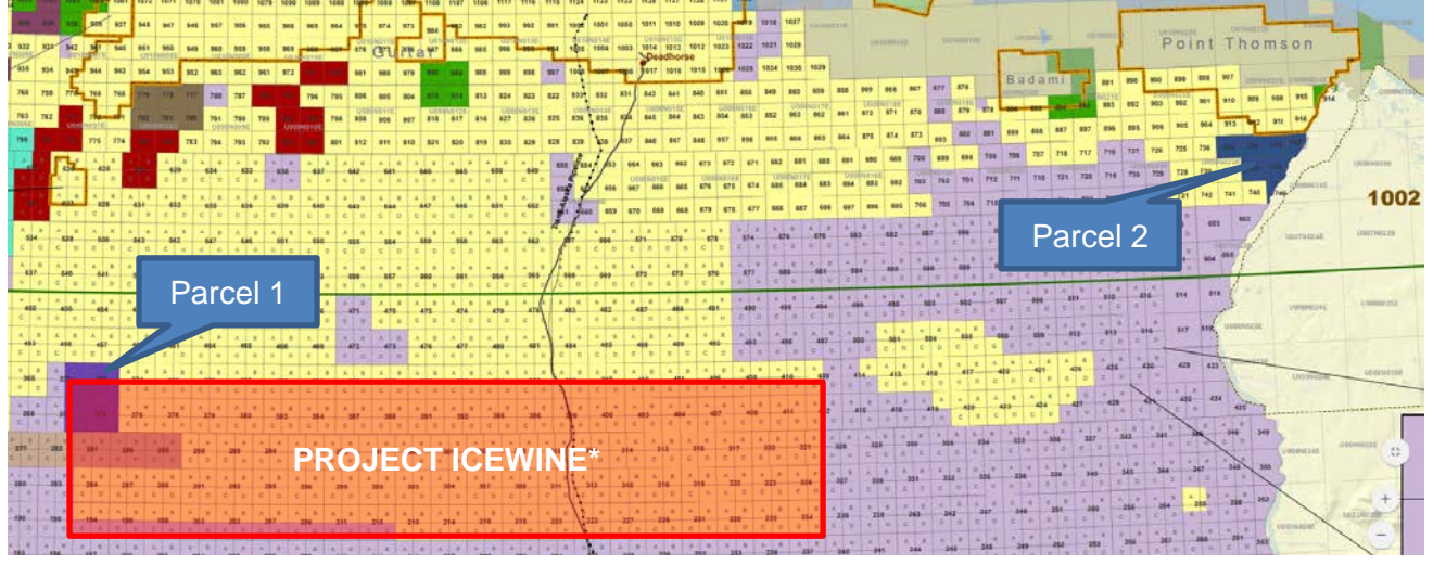
Fig.1 Results Map as per Department of Natural Resources - Division of Oil and Gas website

Additional detail will be provided on the new leases in due course.