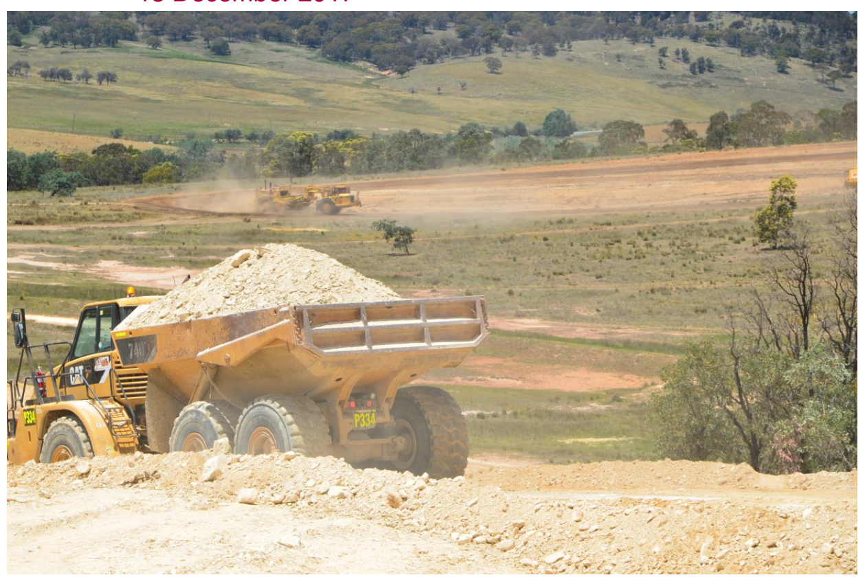
Figure 3: Hauling pad fill in the foreground. Scraper top soil stripping of TSF4 in the background.