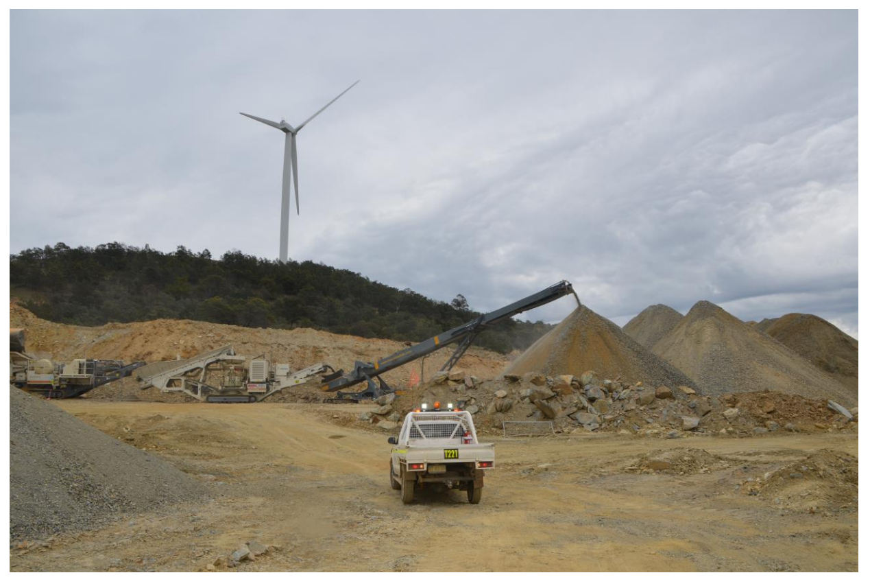
Figure 4: One of two on-site crushers producing final pavement material.