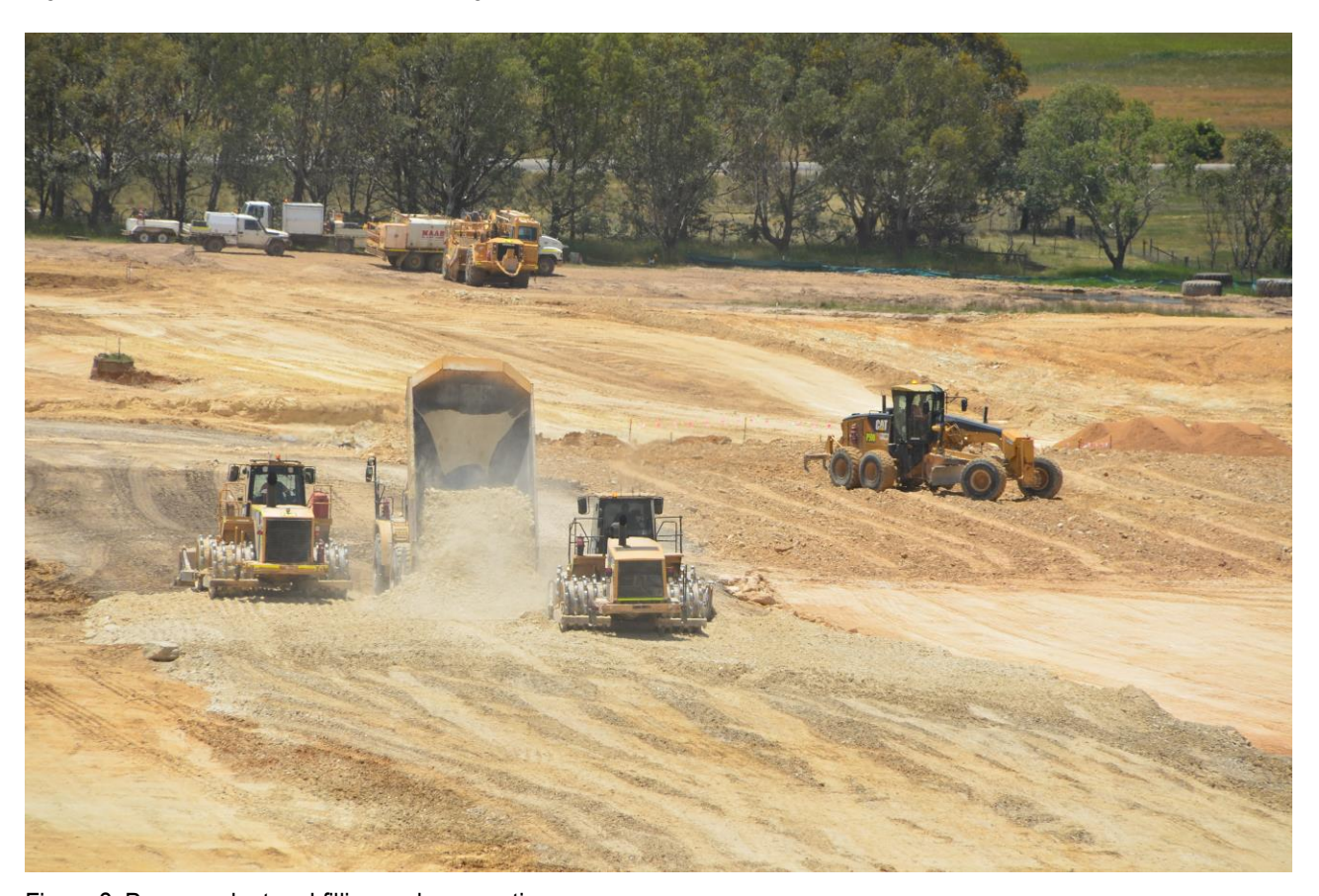
Figure 2: Process plant pad filling and compaction.