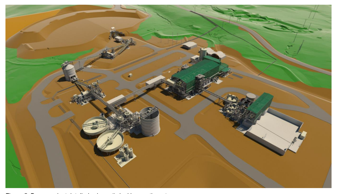
Figure 5: Process plant detailed schematic looking southwest.

November saw a number of contracts awarded covering the paste plant, bins and tanks, overhead crane, HV switchgear, valves, administration building and change rooms. The concrete package was issued for tender with award expected in December. Also for award in December will be the plant structural steel and plate work which should result in fabrication commencing no later than early in the New Year.