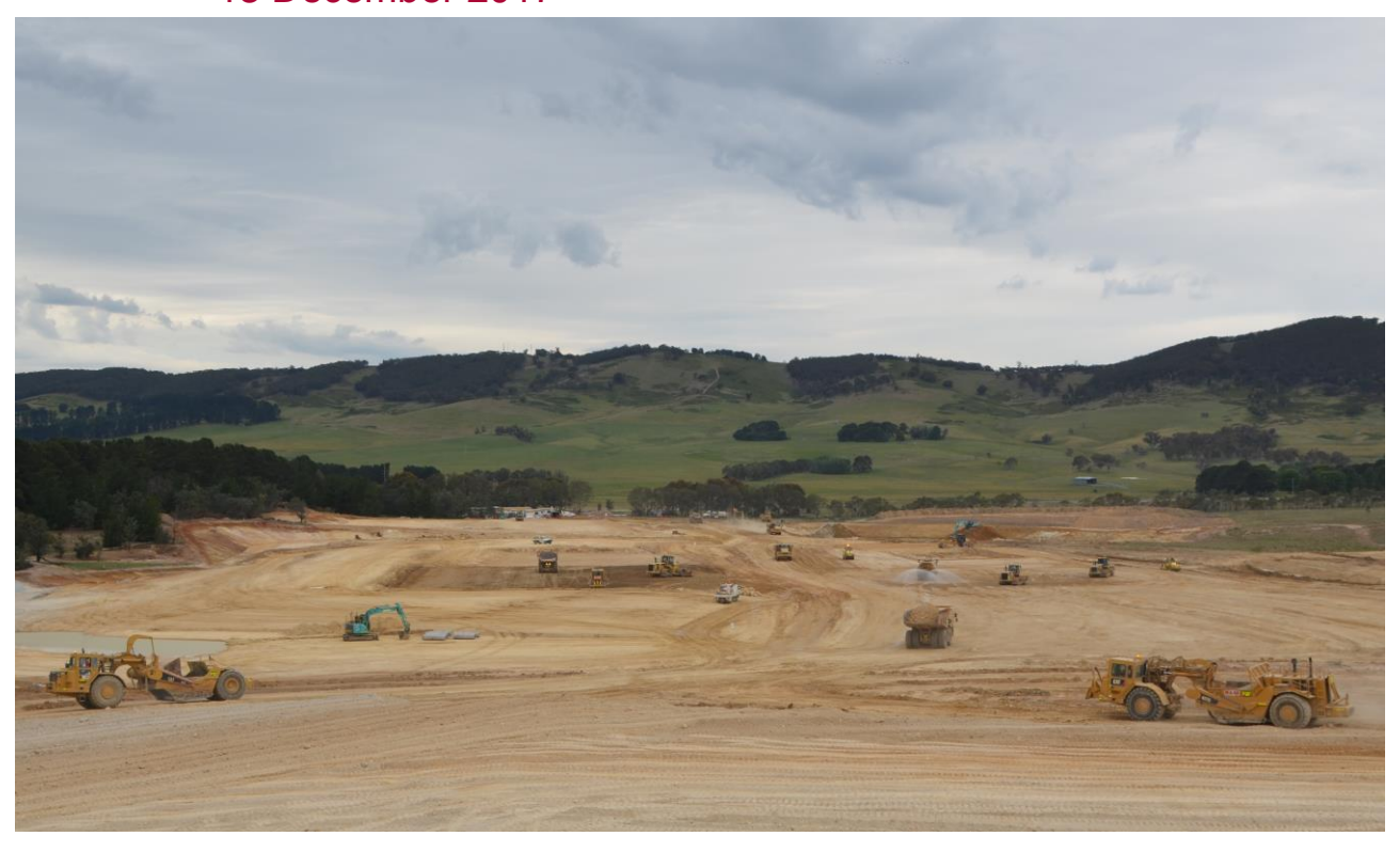
Figure 1: Woodlawn site earthworks looking north from ROM pad.