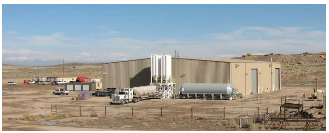
Figure 1: Photo of a Facility on an Industrial Lease.

Successfully securing this industrial site will enable Anson to fast track the development of an infield pilot plant. Figure 1 contains an image of typical industrial facilities within the SITLA areas in the State of Utah.