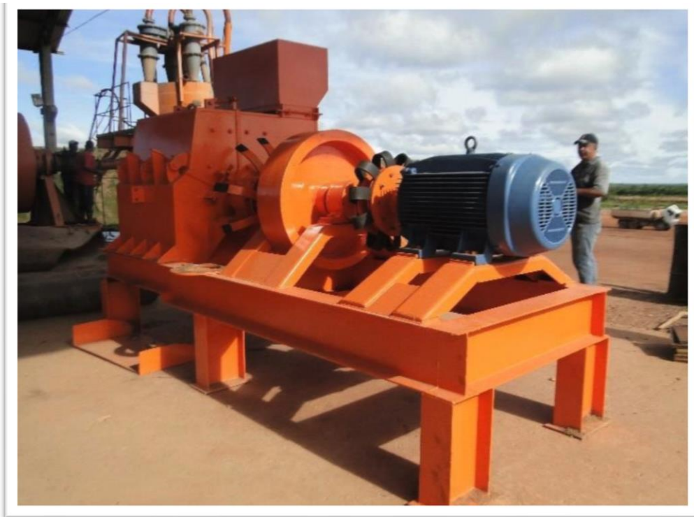
Figure 2. Brazilian made 25-30tph hammer mill

Due to the success of this small pilot plant management is in the process of acquiring a larger 25-30 tonne per hour hammer mill for a cost of less than AU$25,000 (Figure 2). We expect this mill will arrive on site next week and be commissioned the week after. Should the results of the larger mill confirm similar outcomes as the pilot plant's results, management plan to purchase a second similar sized hammer mill in January. The payback on the initial investment is expected to be less than one week should grades be similar to Table 1.