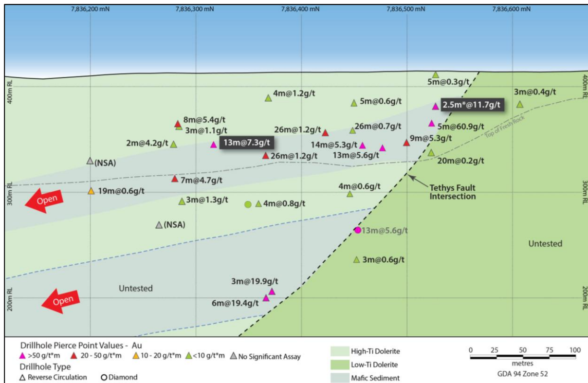
Figure 2. Seuss Fault Long Section with recent results (black highlights)