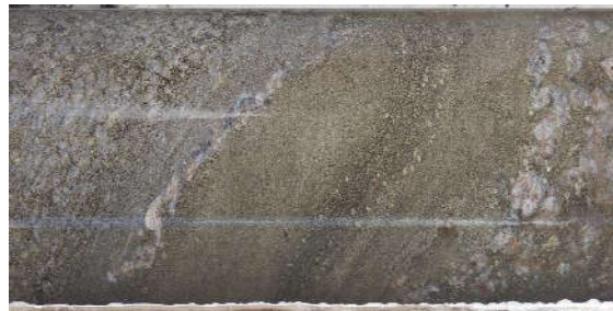
Figure 5. Pyrite band within sphalerite and minor galena