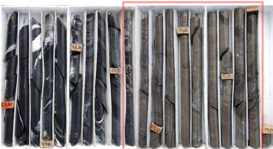
Figure 3. Massive sulphide mineralisation intersected in LV5039 drill hole from 68.25 to 73.85 metres (5.6m); very fine-grained sphalerite overprinted by yellow to reddish sphalerite and minor galena.