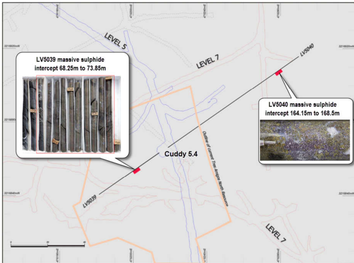
Figure 2. Plan of latest campaign drilling to date from Cuddy 5.4 targeting extensions and infill to the Tres Amigos North resource. LV5039 and LV5040 intersected thick massive sulphides outside of and potentially extending the resource envelope.