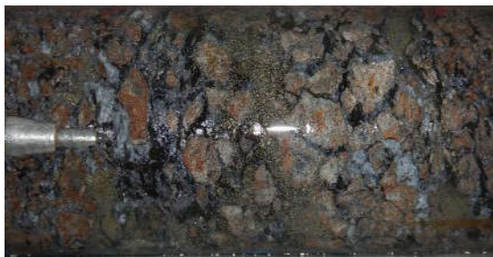
Figure 4. Coarse grained yellow sphalerite overprinting red sphalerite