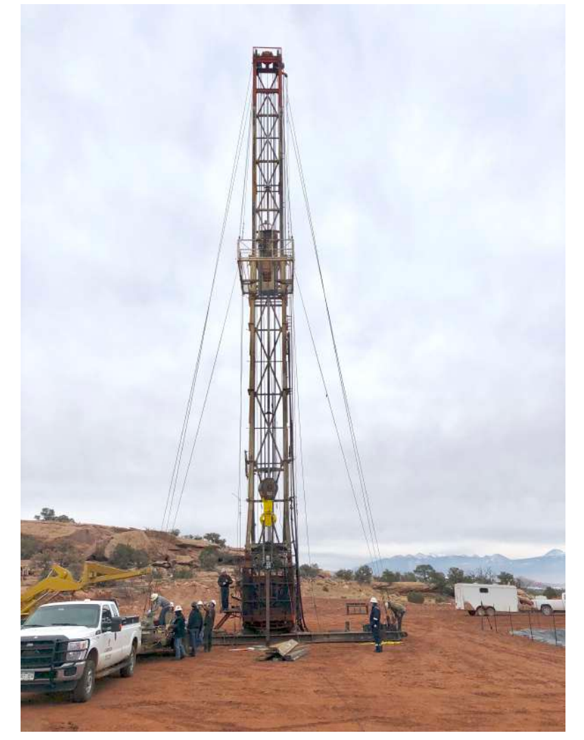
Figure 1: Drill rig set up on site.

Anson Resources Limited (Anson) has commenced re-entry drilling of the Gold Bar Unit 2 well at its Paradox Lithium Project, located in the "Lithium Four Corners" area in Utah. Figure 1 shows the "work-over" rig set up over the Gold Bar Unit 2 well.