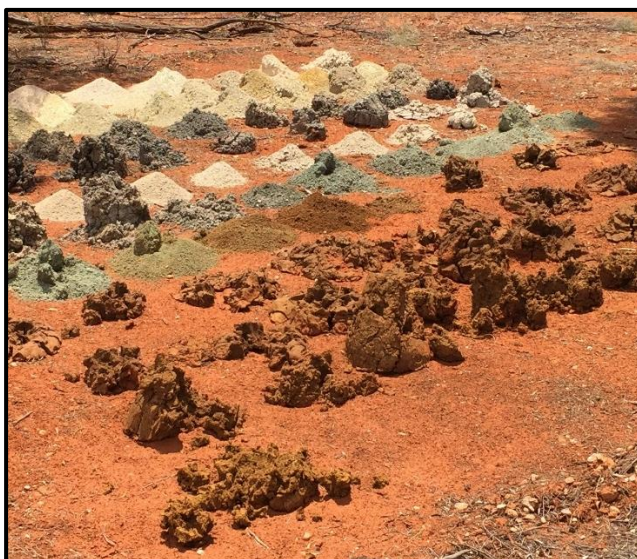
Photo 1 : Aircore Drillhole RKAC151 showing strong Fe-rich clay and goethite development between 73-111m EOH

Petrological examination of the BOH sample in drillhole RKAC151 has identified the host rock as a weathered olivine-rich gabbronorite orthocumulate (Photo 2), which is a favourable host rock for nickel-copper mineralisation. The peak nickel value of 0.40% Ni cannot be fully explained by nickel-in-olivine, when related to the amount of olivine originally present in the gabbronorite, however the value can be explained by the weathering of primary nickel sulphides. The significance of this host rock is further enhanced by the anomalous copper values associated with the nickel assay results.