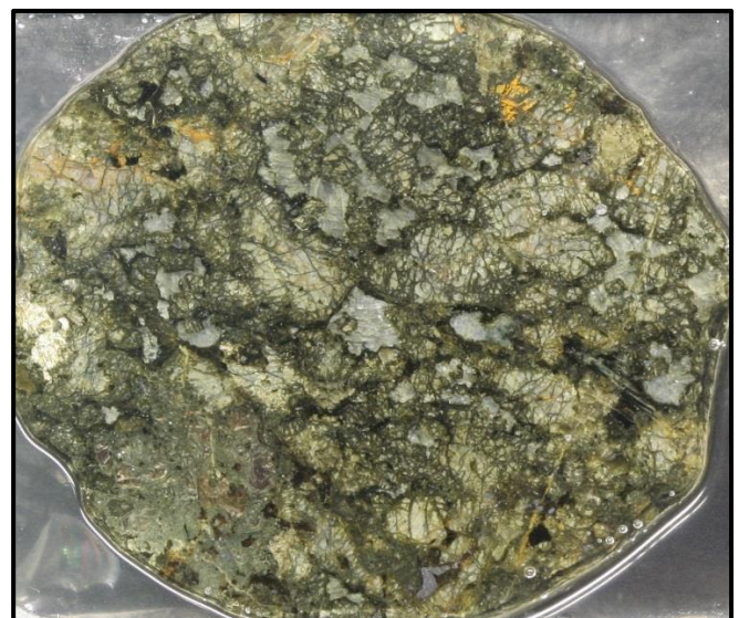
Photo 2 : Olivine Gabbronorite BOH petrology sample from RKAC151. (Photo taken prior to final thin section preparation, width 3cm).