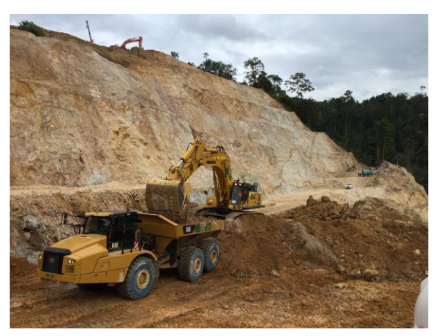
Figure 1: Way Linggo open cut progress

Kingsrose's Indonesian subsidiary PT Natarang Mining ( PTNM ) has commenced the permitting process to expand the Way Linggo open pit and other ancillary permits required to facilitate mining activities into the future.