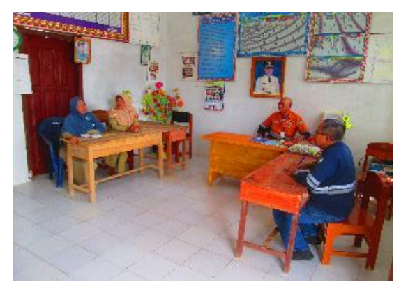
Figure 5: Meetings with local teachers to discuss educational needs in the local villages

PTNM's community development team continues to actively engage the community and keep all community members and stakeholders updated as to the status of the Project's operations. A significant portion of the onsite workforce comes from the local communities surrounding the Project area. Following the decision to suspend underground operations at the Talang Santo Mine, PTNM engaged extensively with the local community in an effort to minimise the impact the suspension would have on the local community. Furthermore, PTNM paid those employees made redundant full redundancy entitlements in line with Indonesian statutory requirements. The support PTNM received at the time of the suspension, and continues to receive from the local community is overwhelmingly positive, and PTNM continues to make every effort to assist the local community achieve their development goals, employ locals and utilise local suppliers wherever possible.