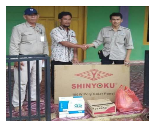
Figure 6: Solar panel donation to the local community