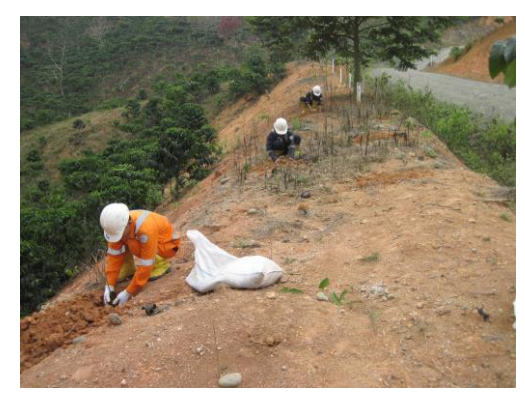
Figure 7: Erosion and sediment control

During the quarter, a total of 0.5 Ha was re-vegetated using a variety of plant stock including Acacia, Medang, Mahoni, Sengon, Sonokeling and Trembesi at the reclamation guarantee area and along the mine road. Some of the plants are fruit trees (e.g Durian, Pala) which the local community will utilise.