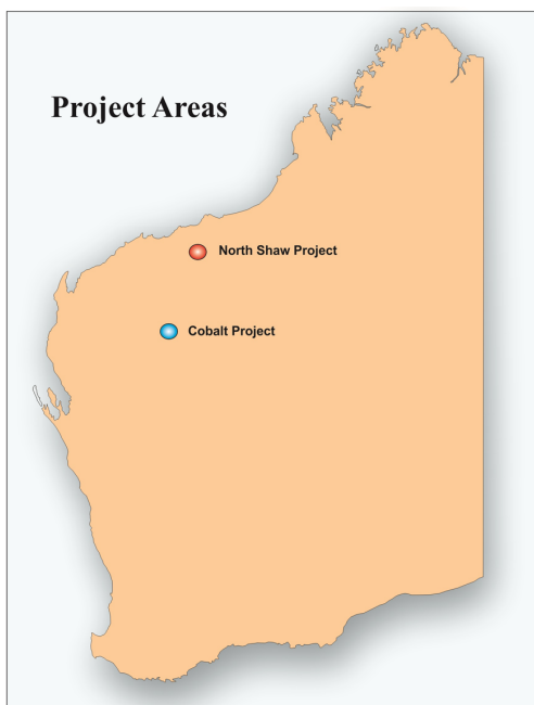
Figure 3 Project areas