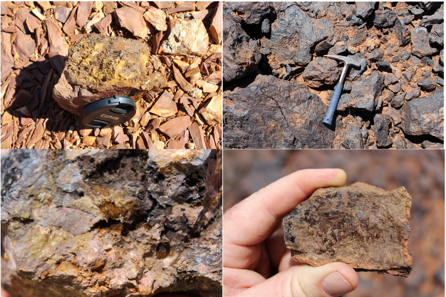
Figure 2 Rock chips from reconnaissance mapping: top right – ferruginous sedimentary breccia; top left - strongly manganiferous, fine grained sediment; Bottom left and right – fine iron oxides, possibly after sulphides, within fine grained sedimentary units.