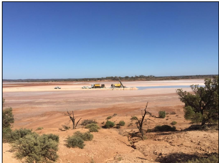
Figure 1. Drilling continues at Slate Dam,

Aruma Resources Limited is a West Australian focused gold exploration company, with advanced projects in the Kalgoorlie gold district. Aruma's leases, inclusive of applications, cover 750km 2 of which 30km 2 are under joint venture (Southern Gold Ltd) with the remainder wholly operated by Aruma.