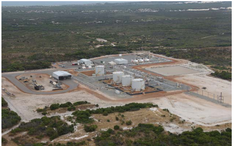
Arrowsmith Stabilisation Plant

The Cliff Head facilities are the only offshore infrastructure in the Perth Basin and are therefore important for any development in the surrounding area. An unmanned platform with a 14km pipeline carries the crude oil to a dedicated stabilisation processing plant at Arrowsmith with a production capacity of 15,000 bopd.