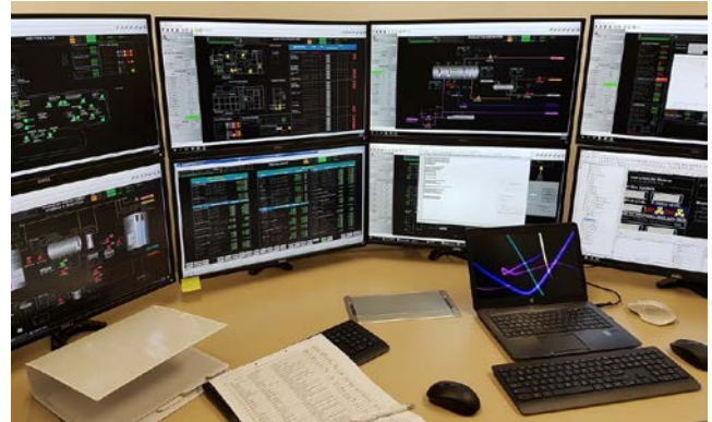
Testing of new Operations Centre in West Perth

Studies are also being undertaken in 2018 to finalise requirements to fully de-man the Arrowsmith Stabilisation Plant facility and relocate the Operations Room to Perth, which is also part of Triangle's long-term strategy for asset transformation.