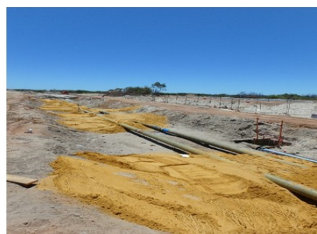
Injection Water Pipeline Integrity Project