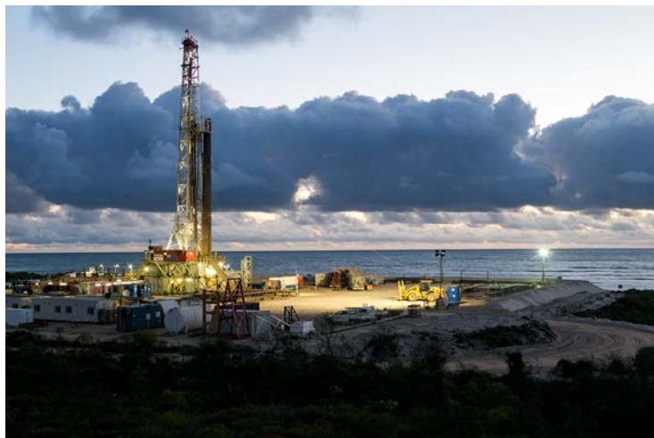
Figure 1: Drilling of Xanadu-1 well

On 25 September 2017, Triangle announced that an oil discovery at Xanadu-1 was confirmed. This was an outstanding achievement and the first oil discovery in the offshore Perth Basin since Cliff Head over 15 years ago.