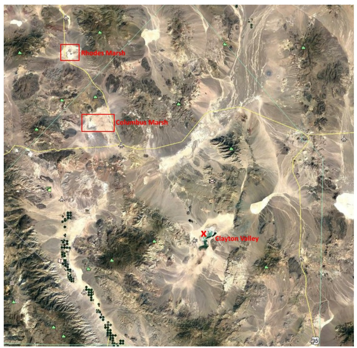
Figure 1: Lithium Brine Projects