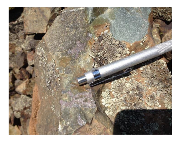
Figure 2 Figure 3

The cobalt mineralisation identified in the workings is interpreted to lie within a 4-5m wide sedimentary unit which strikes north-south and dips at about 30 degrees west. Antasitua has indicated that the local geological setting may host primary feeder-type veins within the underlying andesite volcanic sequence, providing an additional exploration target for follow up.