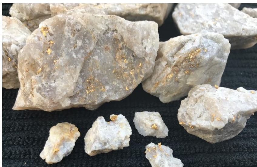
Figure 3: Example of visible gold in rock samples taken from around the Lady Ada deposit (see announcement dated 12 Sept 2017)