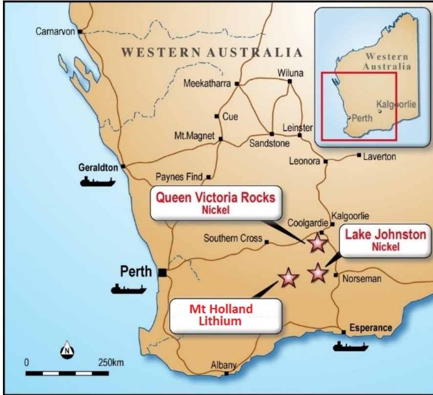
Figure 1: Location Map showing Hannans’ Forresteria Project (adjacent to Mt Holland Lithium) and Queen Victoria Rocks Project and Lake Johnston Joint Venture Project (Hannans free-carried)