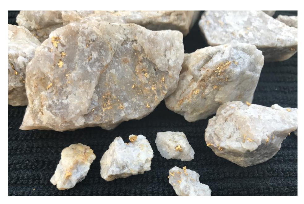
Figure 2: Example of visible gold in rock samples taken from around the Lady Ada deposit (see announcement dated 12 Sept 2017)