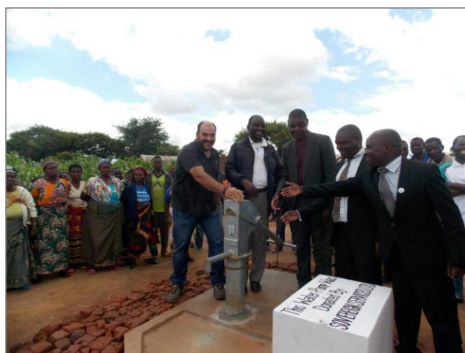
Figure 3 (LHS): A new water bore and pump installed for local communities by Sovereign Services Ltd, a subsidiary of Sovereign Metals.