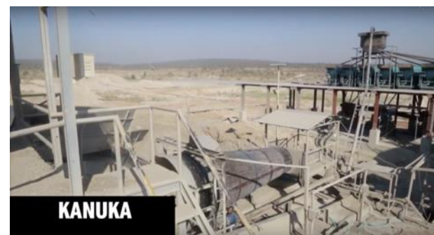
Figure 6 and 7: The site offices and processing plant on PE13082