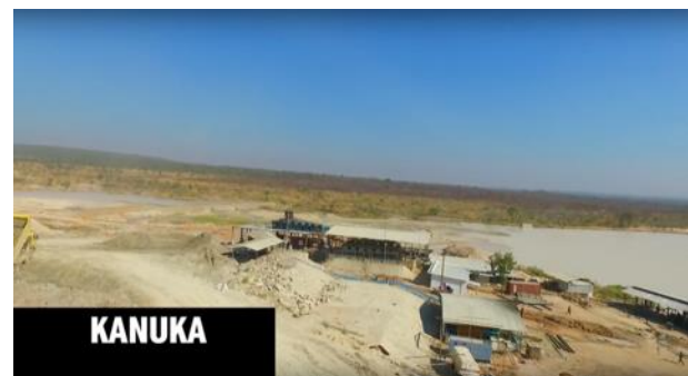
Figure 4, 5, 6 and 7: Mining activity has exposed significant pegmatite exposures on the license areas

Numerous pegmatites have been exposed throughout the license areas by the current and previous mining activities.