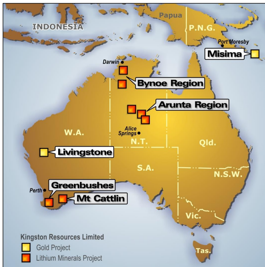
KSN project locations.

The Company also holds an attractive portfolio of lithium exploration tenements covering four key project areas in the Northern Territory, where the Bynoe Project is home to some exciting new discoveries and the Arunta Project lies within a significant pegmatite field. In addition, the Livingstone Gold Project holds a 50koz resource and is the site of a number of high grade historic intersections.