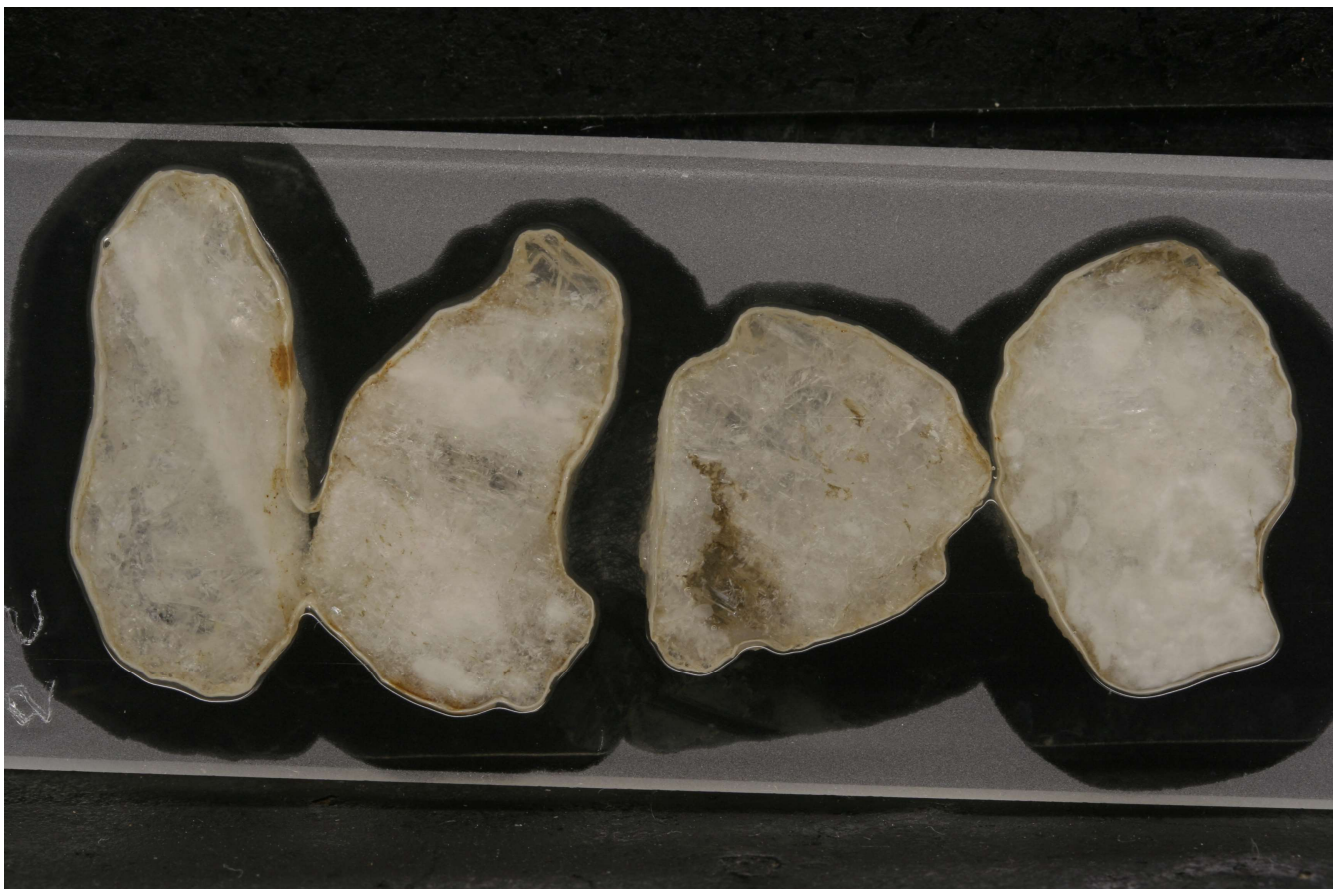
Photograph 1 Select drill chips with spodumene identified (height of slide ~26mm)

The spodumene occurs as roughly prismatic to blocky crystals to 10mm, in association with quartz as intergrowths (Photograph 1 and 2), some vein-like <10-mm, spotty masses of <1-mm and semi-radiating columnar prismatic to almost fibrous spodumene, and <2.5-mm intergrowths of anhedral spodumene. The spodumene occurs with quartz intergrowths and is interpreted to represent alteration of the lithium mineral petalite as cooling of the pegmatite body occurred. Similar alteration and quartz intergrowths is evident in other pegmatite orebodies around the world.