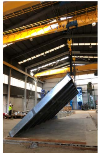
Images showing casting of lightweight slab panels to assess the manufacturing process.