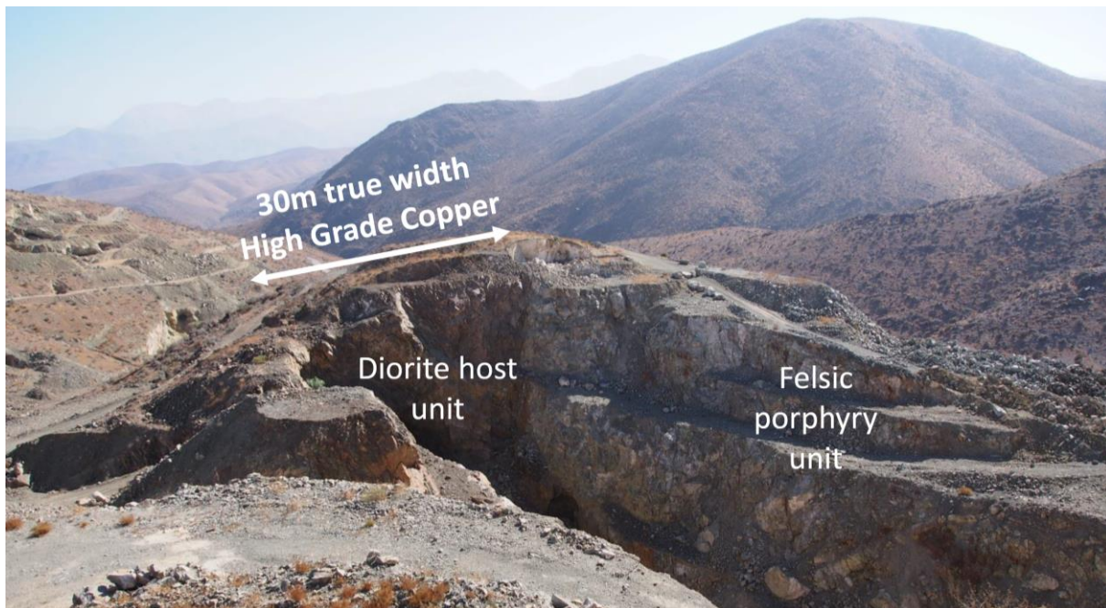
Figure 3. Photo looking north across surface and underground mine workings at the San Antonio copper mine, El Fuego copper project. Copper ore associated with chalcopyrite and bornite sulphide mineralogy has been extracted from surface.

In addition, the Company is expecting to release the results of an infill soil sampling programme which has recently been completed across the southern extent of San Antonio. The soil programme aimed to confirm and refine four +1km long copper soil geochemical anomalies which had been previously detected in favourable host stratigraphy.