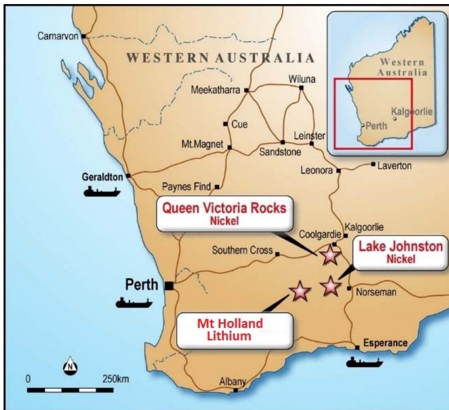
Figure 1: Location Map showing Hannans’ Forresteria Project (adjacent to Mt Holland Lithium) and Queen Victoria Rocks Project and Lake Johnston Joint Venture Project (Hannans free-carried)