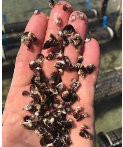
Left – Spat showing good growth at Cowell

Below are some photos taken during a grading operation at Cowell on the 10 March 2018.