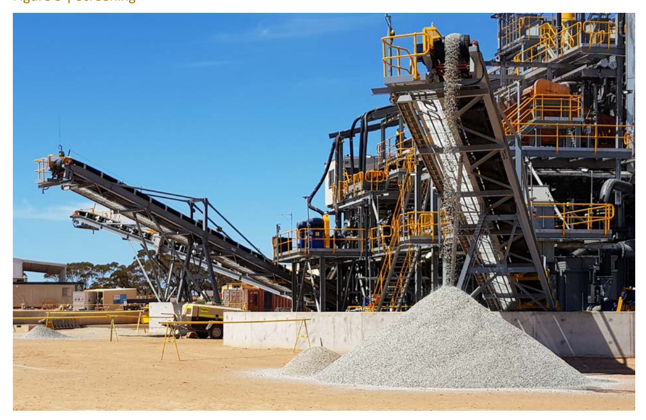
Figure 4 | Stockpiles