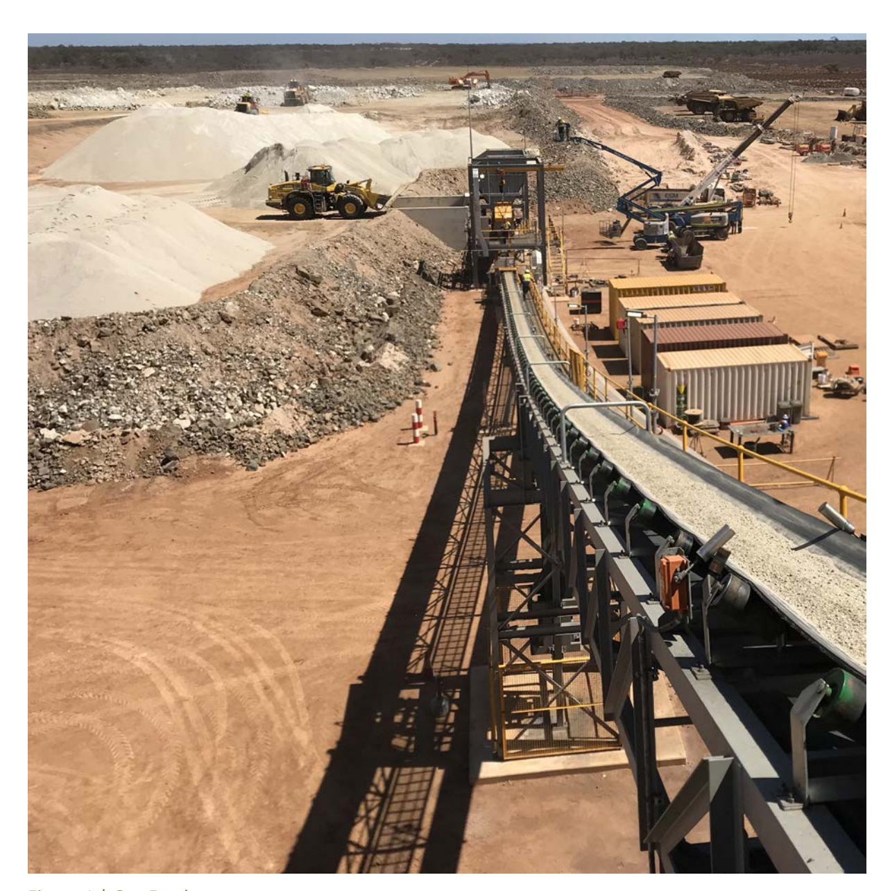
Figure 1 | Ore Feed