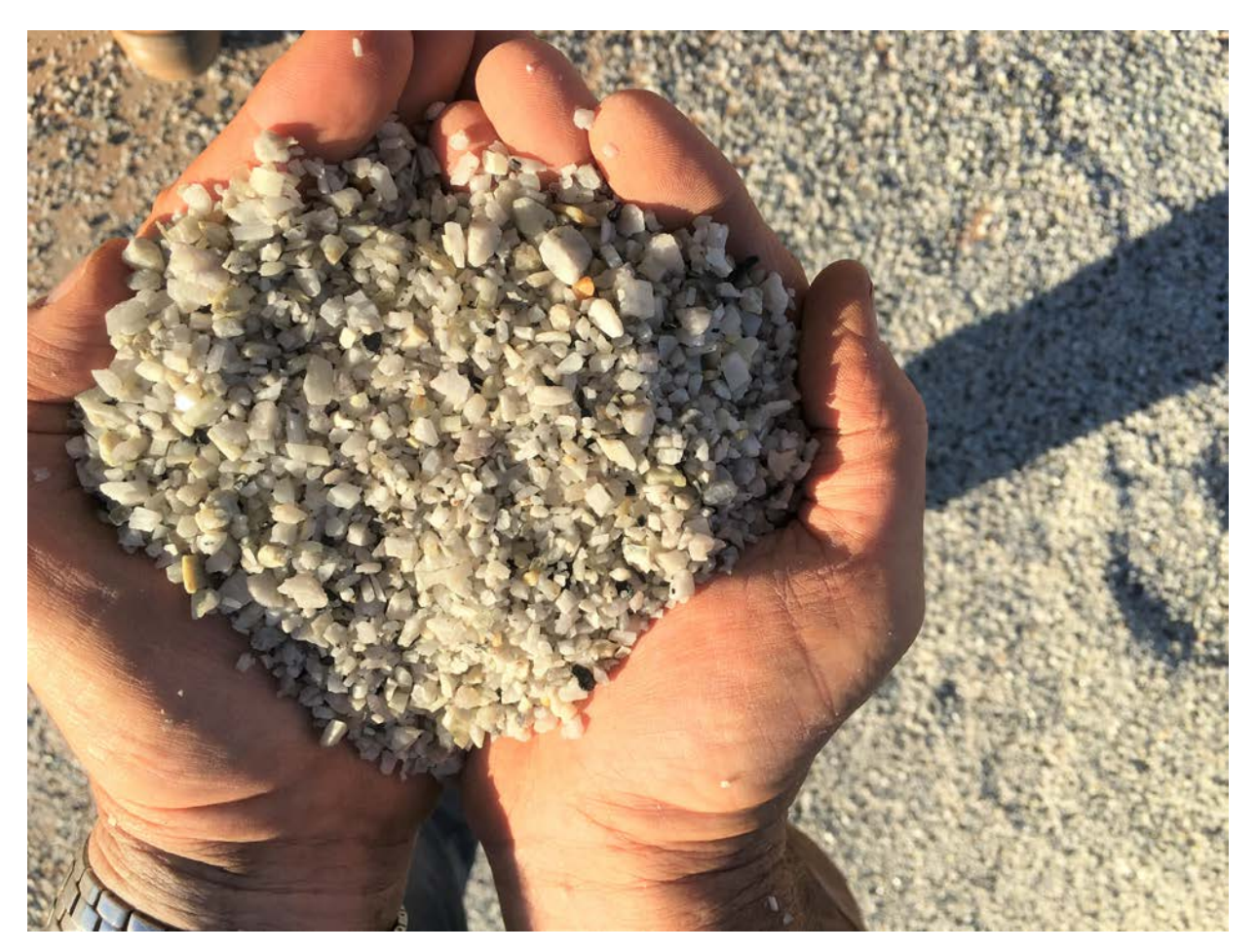
Figure 5 | Spodumene concentrate