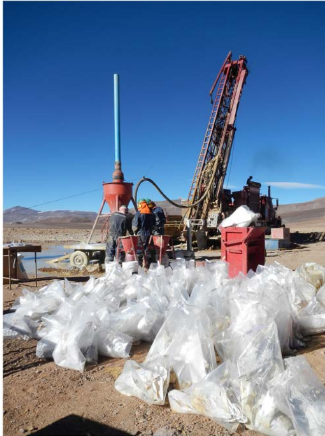
Samples from RC Pre-collar