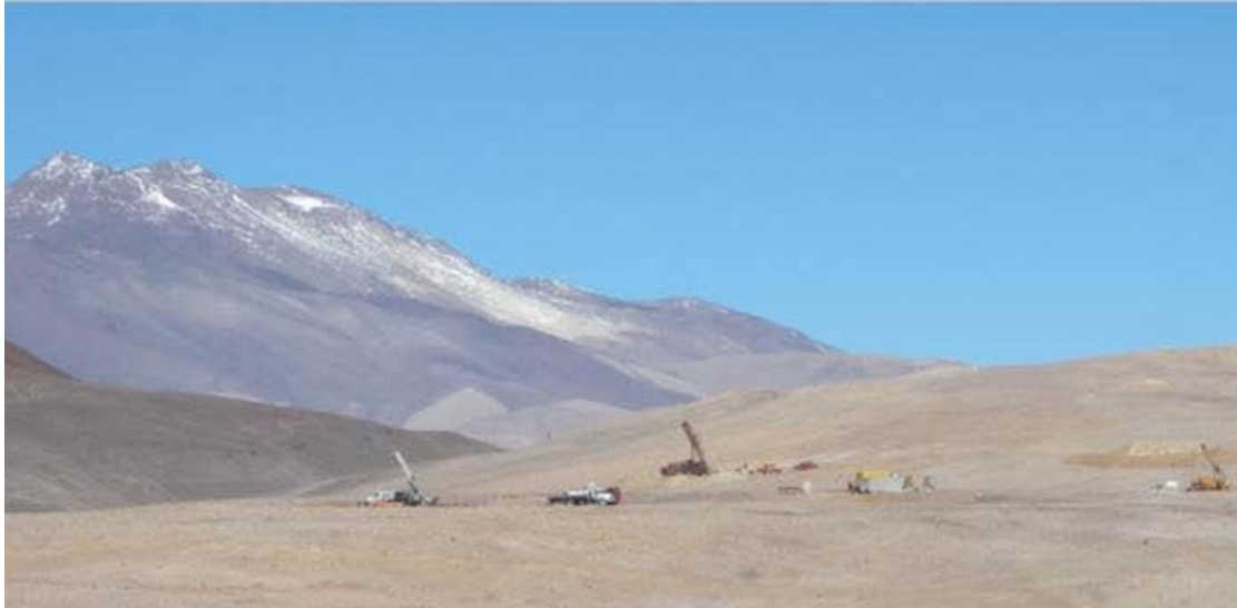
Three drill rigs currently working at Vidalita