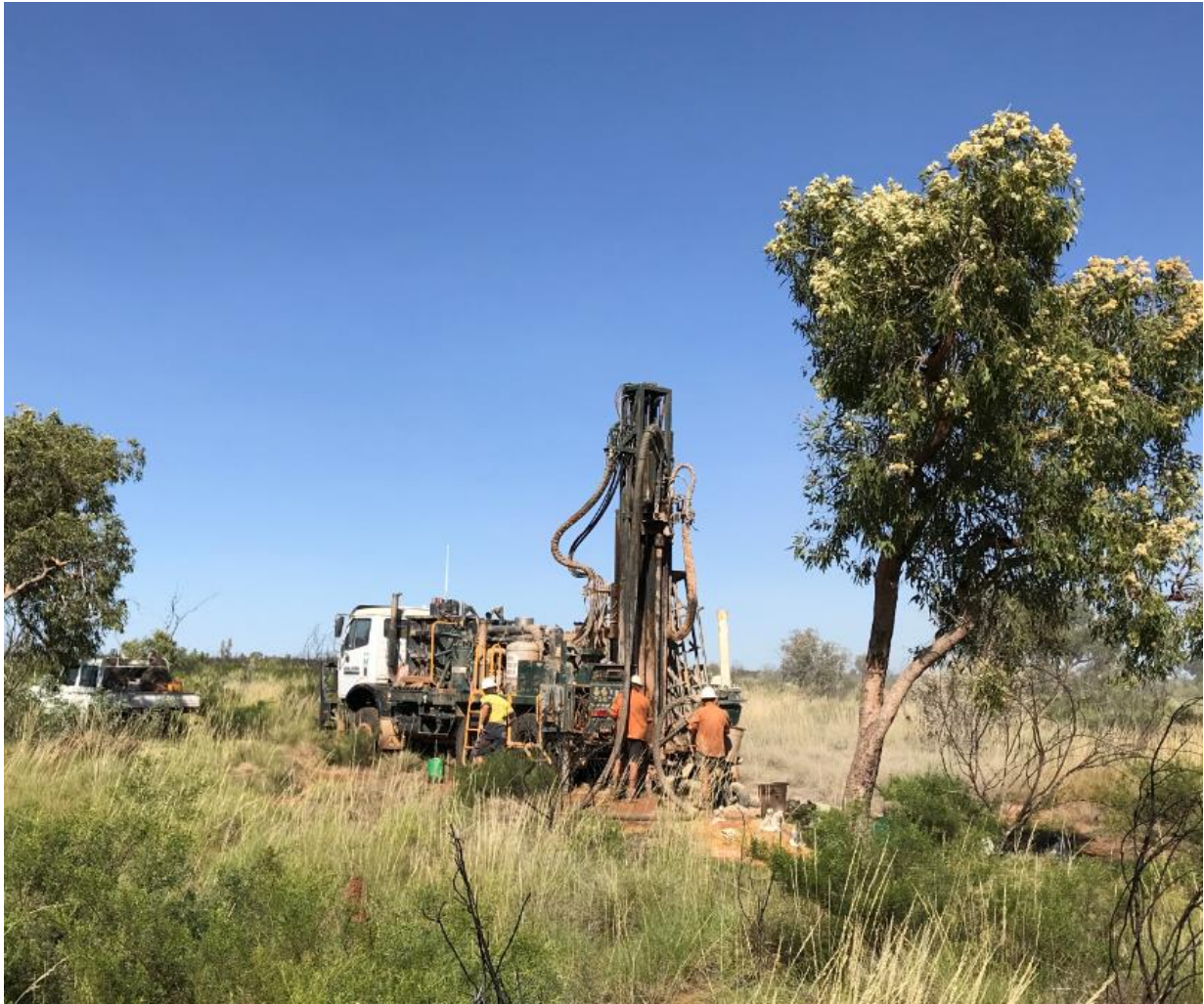
Figure 1. Aircore drilling underway at the Capstan Prospect