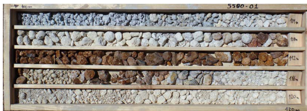
Figure 10 – Air core hole 5500-1: with distinct dark quartz veining, similar to that observed in the discovery outcrop