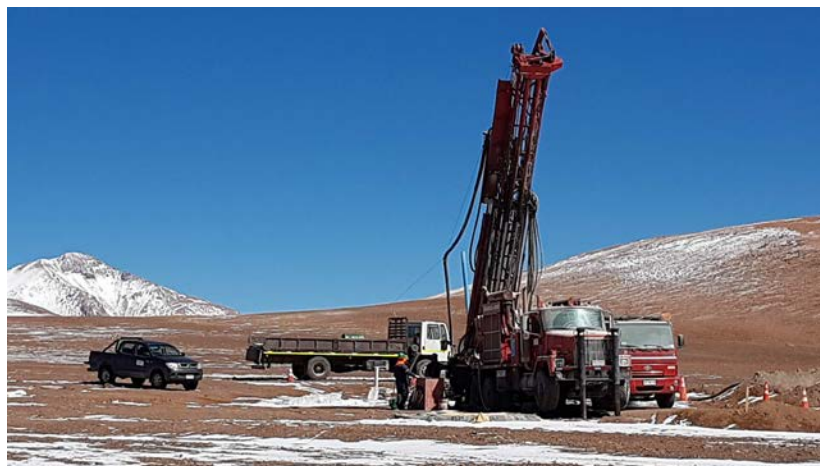
Figure 5 – rig TH75 drilling reverse circulation hole 5300-1