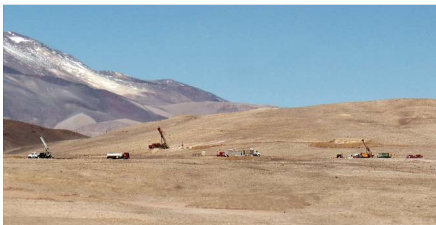
Figure 2 - Drill rigs at Vidalita, March 2018. From left, DD rig LF90D drilling hole 5700-1, RC rig TH75 drilling hole 5300-1, AC rig D34 drilling hole 5500-2.

Included in this release are photographs of intervals of core that, based on the evidence of surface rock sample results, could be mineralised. A brief comment is included below each photograph.