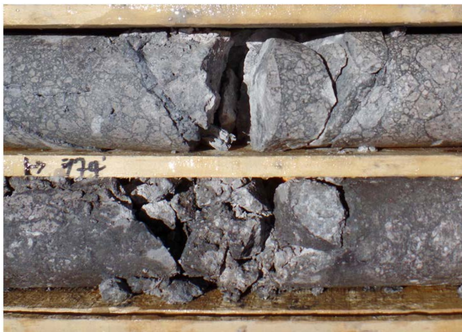
Figure 8 – Close-up hole 5700-1: 74m (wet) breccia showing alunite alteration (pink)