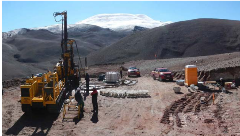
Figure 4 - rig D34 drilling air core hole 8500-1