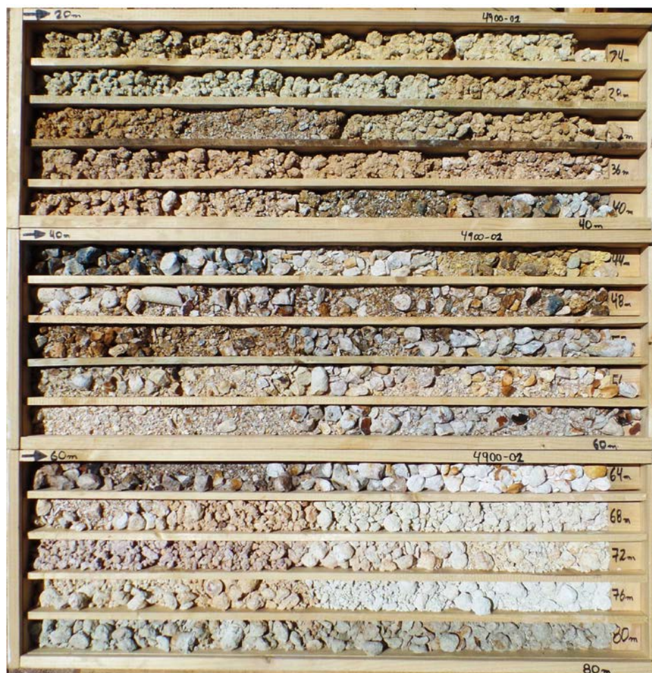
Figure 9 – Air core hole 4900-1: showing structural controlled silica replacement from 36 to 64m