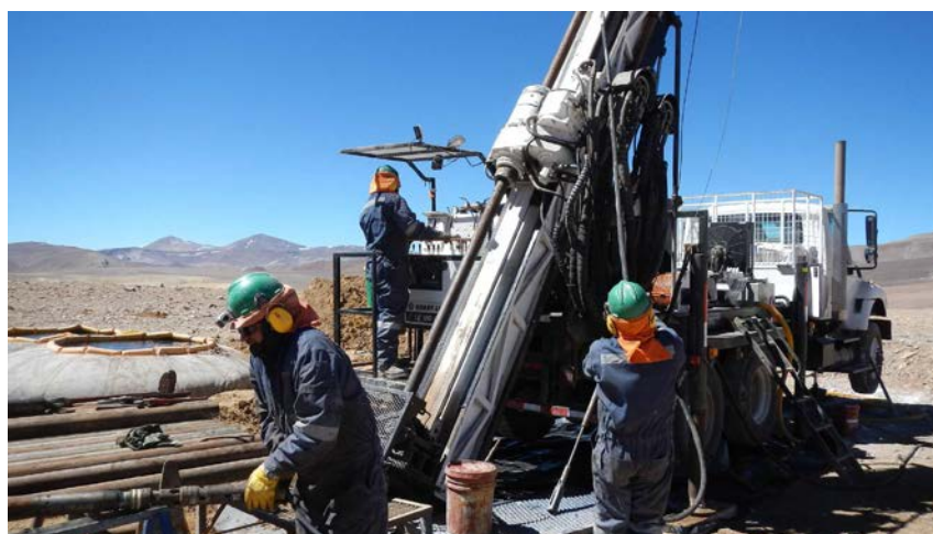
Figure 1 – rig LF90D drilling diamond drill hole 5700-1

The drilling completed to 27 March in the 2018 exploration campaign is summarised in Table 1. To 27 March 2018, a total of 2,533 metres have been drilled.