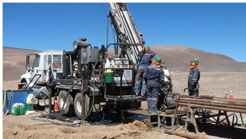
Figure 6 – rig LF90D drilling diamond drill hole 5700-1