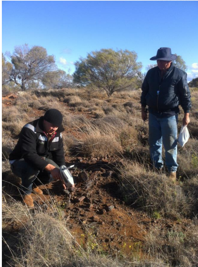
Image 1 Field sampling at Fraser Range using portable XRF

With the price of Cobalt rising steadily as demand increases, as well as the increased interest from other explorers in the area, the Company is of the opinion that the rock chips demonstrate potential for large scale economic mineralisation and warrant further follow up.