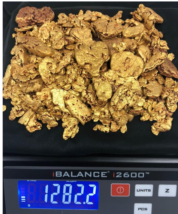
Figure 1: 1,282.2 grams of gold nuggets recently recovered from 47K Patch.