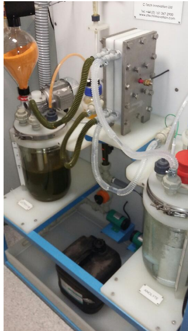
Figure 2: Electrolyte Pilot Plant. 99.6% V_2O_5 (orange), feeding AVL electrolyte balancing pilot plant