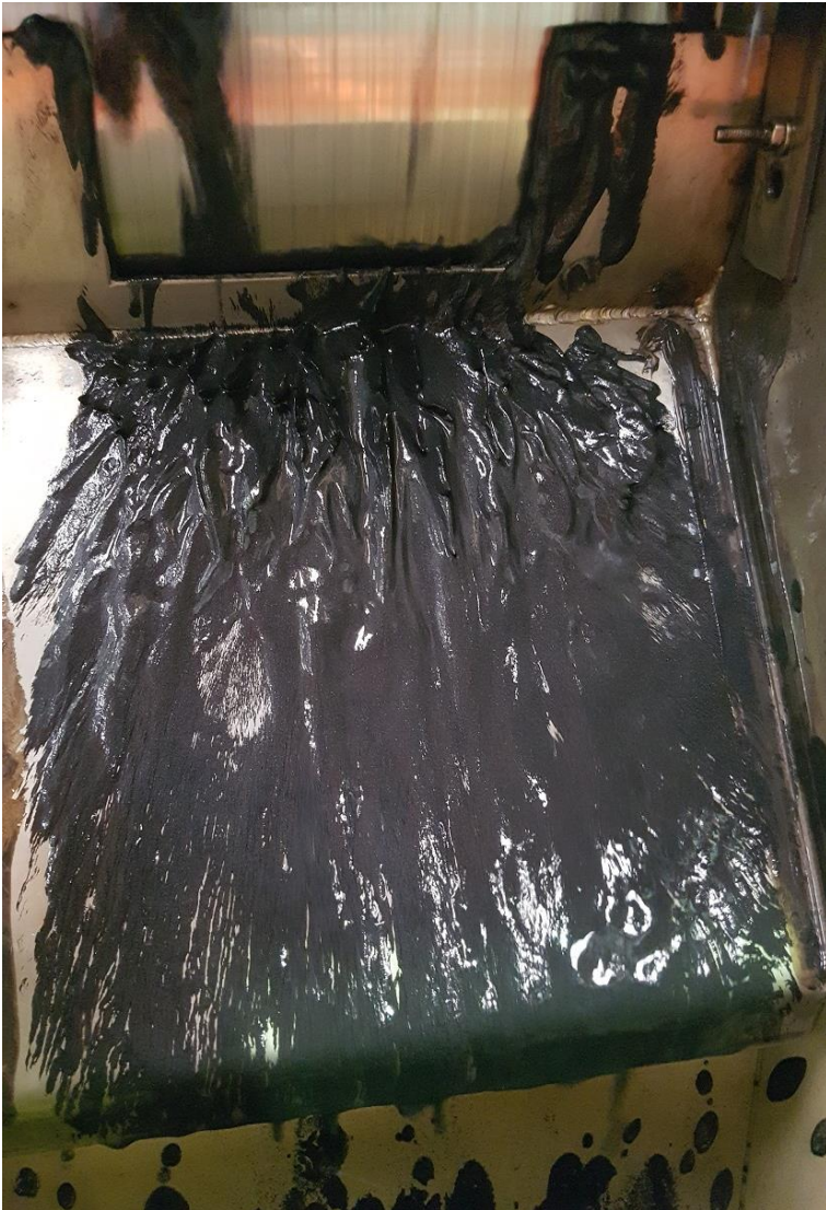
Figure 1: An example of magnetic concentrate (titaniferous magnetite containing vanadium) from a fresh rock sample