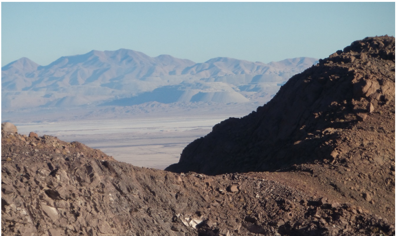
View of Chuquicamata Mine dumps from Tuina