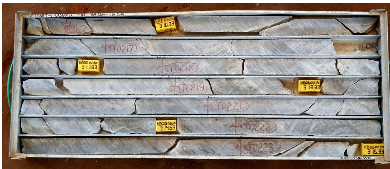
Figure 1: KBDD001A lower zone full core tray sampled