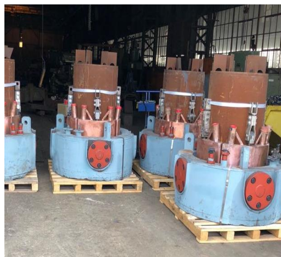
Figure 4: Lower Electrode Copper Contact Shoes and Stainless Steel Pressure Ring on pallets, ready for shipping