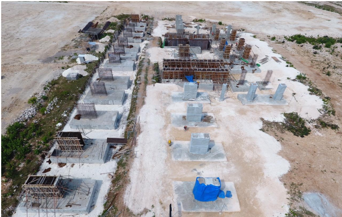
Figure 6: Aerial overview demonstrating civil works progress to date