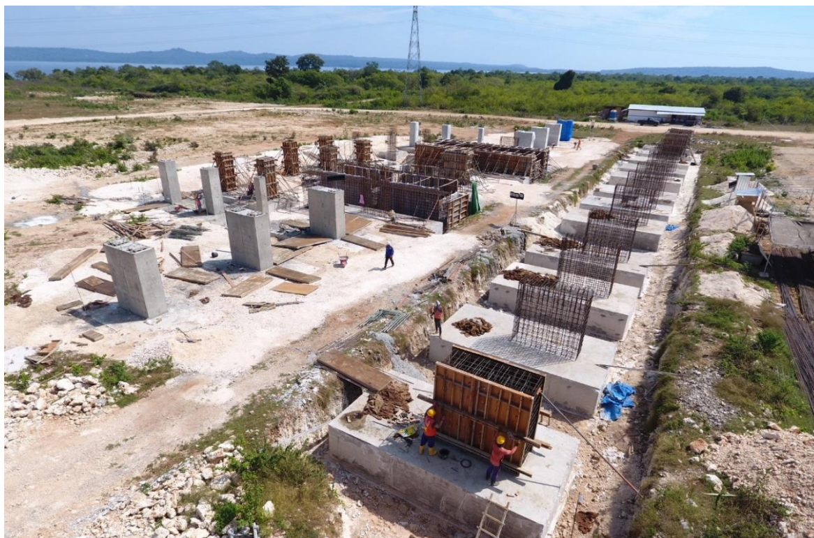
Figure 7: Civil works program is well advanced at Kupang Smelting Hub site