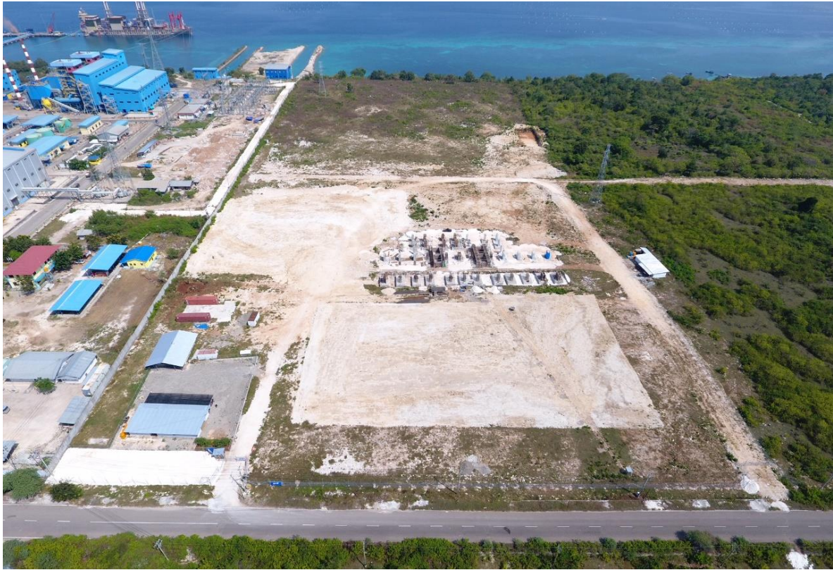
Figure 5: Aerial overview of the Kupang Smelting Hub Facility site highlighting close proximity to power station (top left)