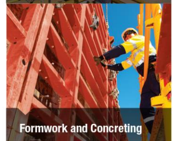
Formwork and Concreting