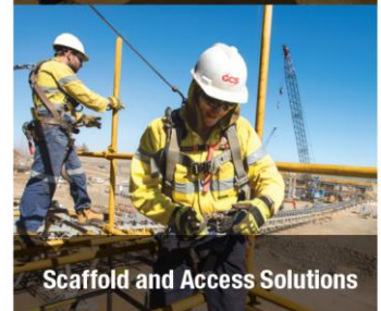
Scaffold and Access Solutions