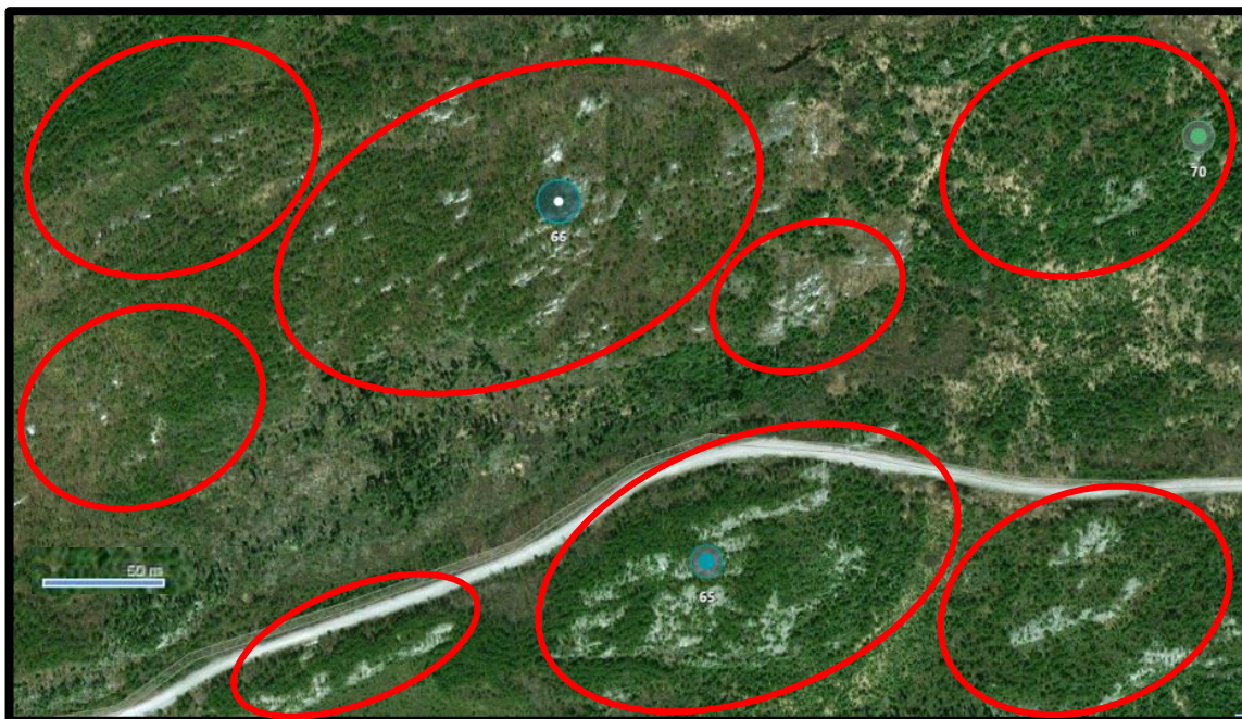
Figure 2. Satellite image of Target area 65, 66 and 70 next to the all-weather road, showing numerous rock exposures that require further investigation to determine if there are any spodumene bearing pegmatites structures.

A mapping and sampling program is scheduled to commence early next week, as the winter snow is clearing from the ground, which will allow for a detailed inspection of these and many other locations across the project.